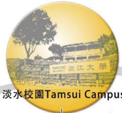
淡水校園 Tamsui Campus