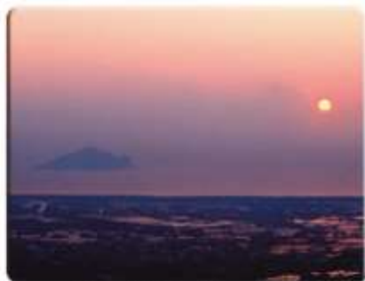
[龜山日出 Kwei-shan Sunrise]