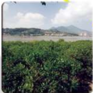
[淡水河紅樹林自然保留區] [Mangrove Conservation Area]