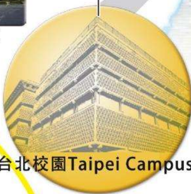
台北校園 Taipei Campus