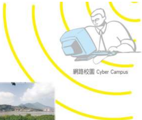
網路校園 Cyber Campus