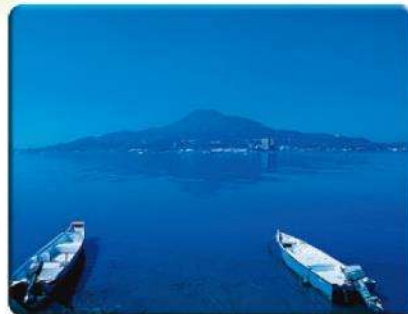
[觀音山 Kuanyin Mountain]