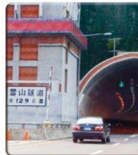
[雪山隧道 The Hsuehsh...