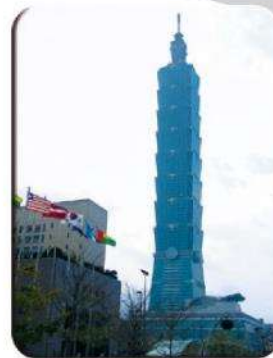
[台北101國際金融中心] [Taipei 101 Financial Center]