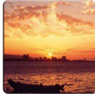
[淡海夕照 Tanhai Sunset]