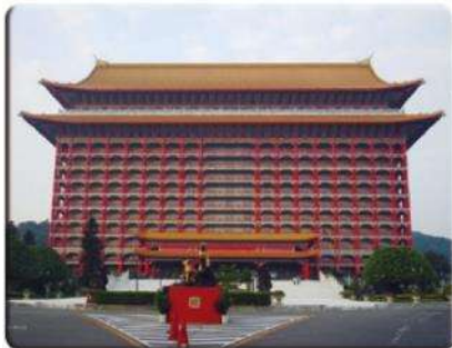
[圓山大飯店 The Grand Hotel]