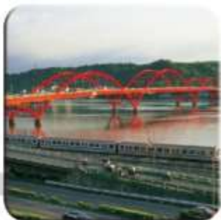
[關渡大橋 Kuaritu Bridge]